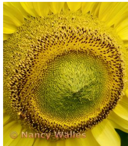
2nd intermediate Assign-