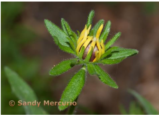
2nd Basic Assignment