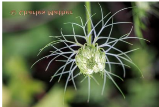
2nd Advanced Assignment