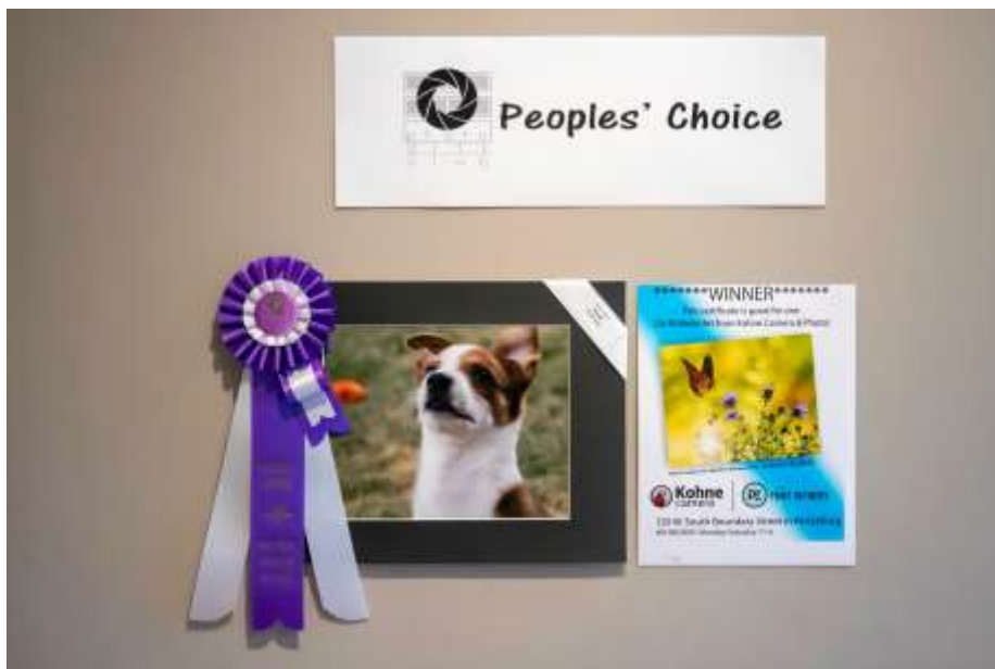
Last Year's Peoples' Choice