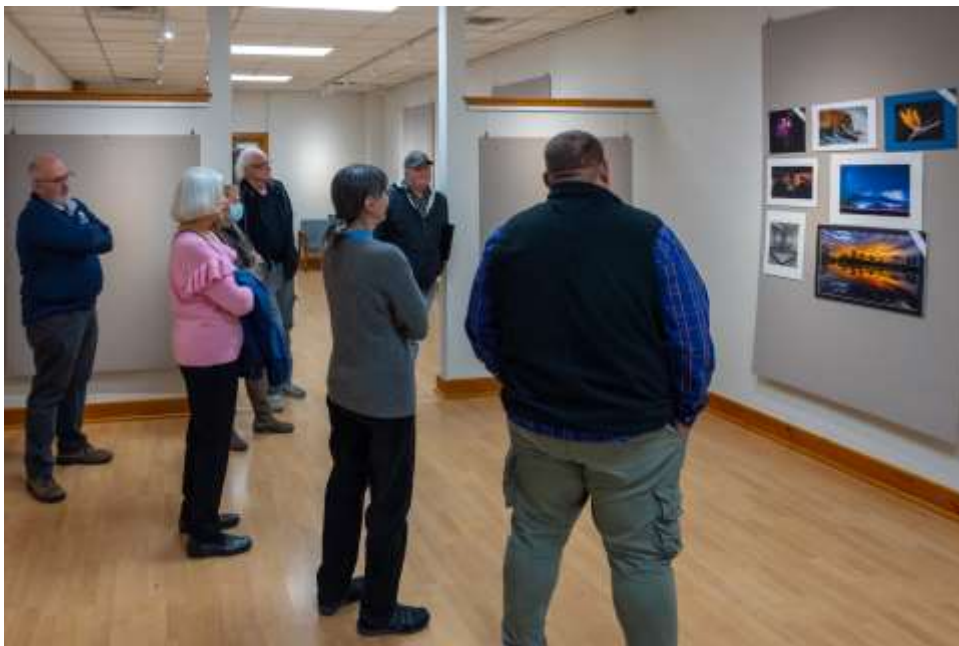
Best of Show judging for Annual Contest

The March photo competition opened February 17th. The Assignment is Light Fixture, lit or unlit, make the lamp, chandelier or fixture be the main subject of the photo. There is the Open category too. You can submit up to 3 photos between the two categories. If you would like to enter photos, please let me know what level you would like to be in: Basic, Intermediate or Advanced. These close March 16th.