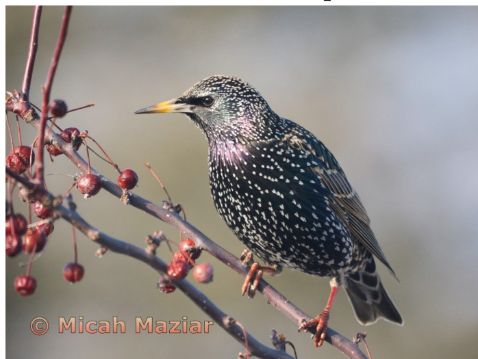
1st place intermediate open